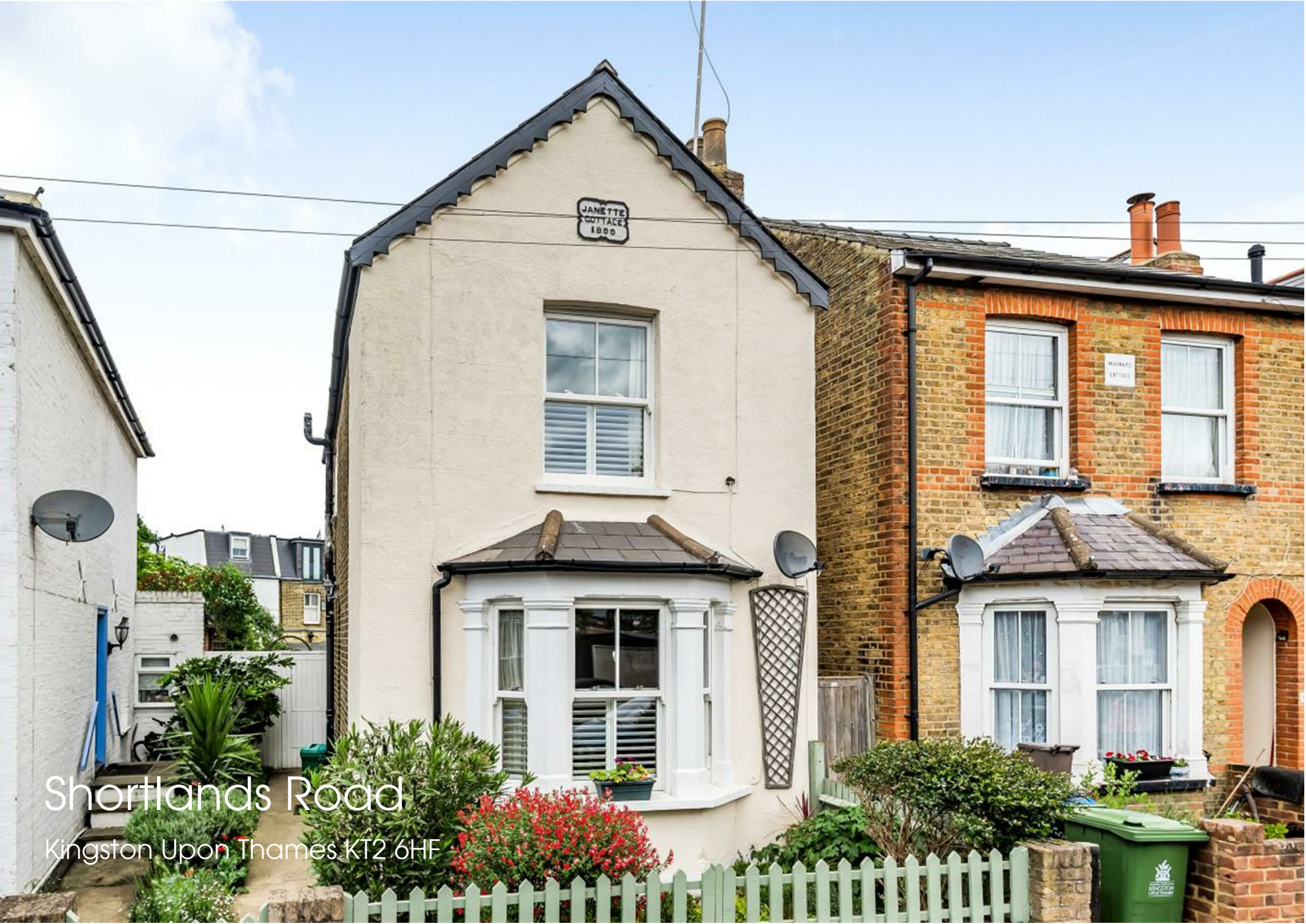
Shortlands Road Kingston Upon Thames KT2 6HF